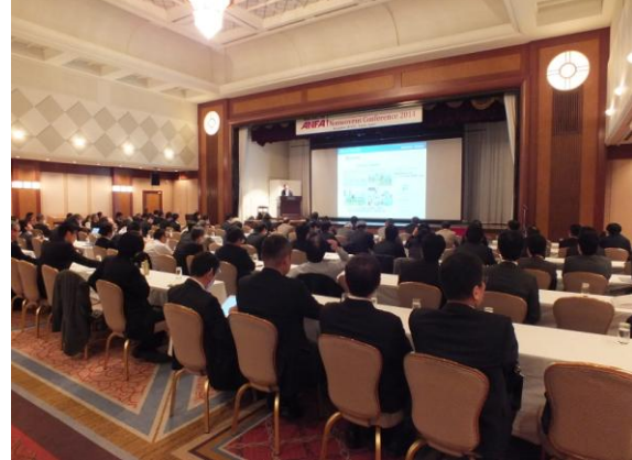
Product presentation, Room 2