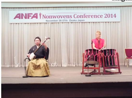
Social gathering hall