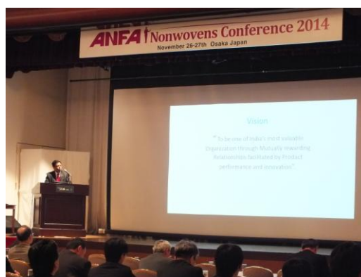
Product presentation, Room 1