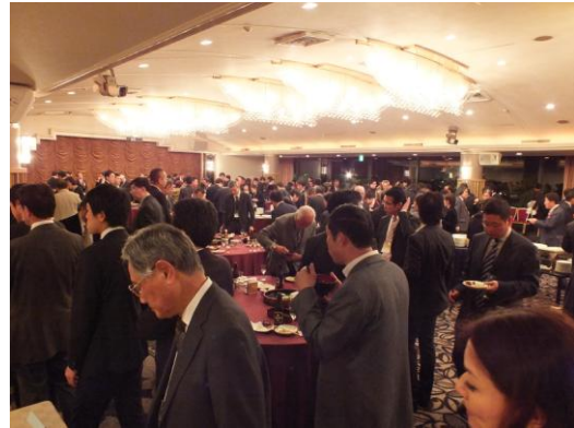
Social gathering hall